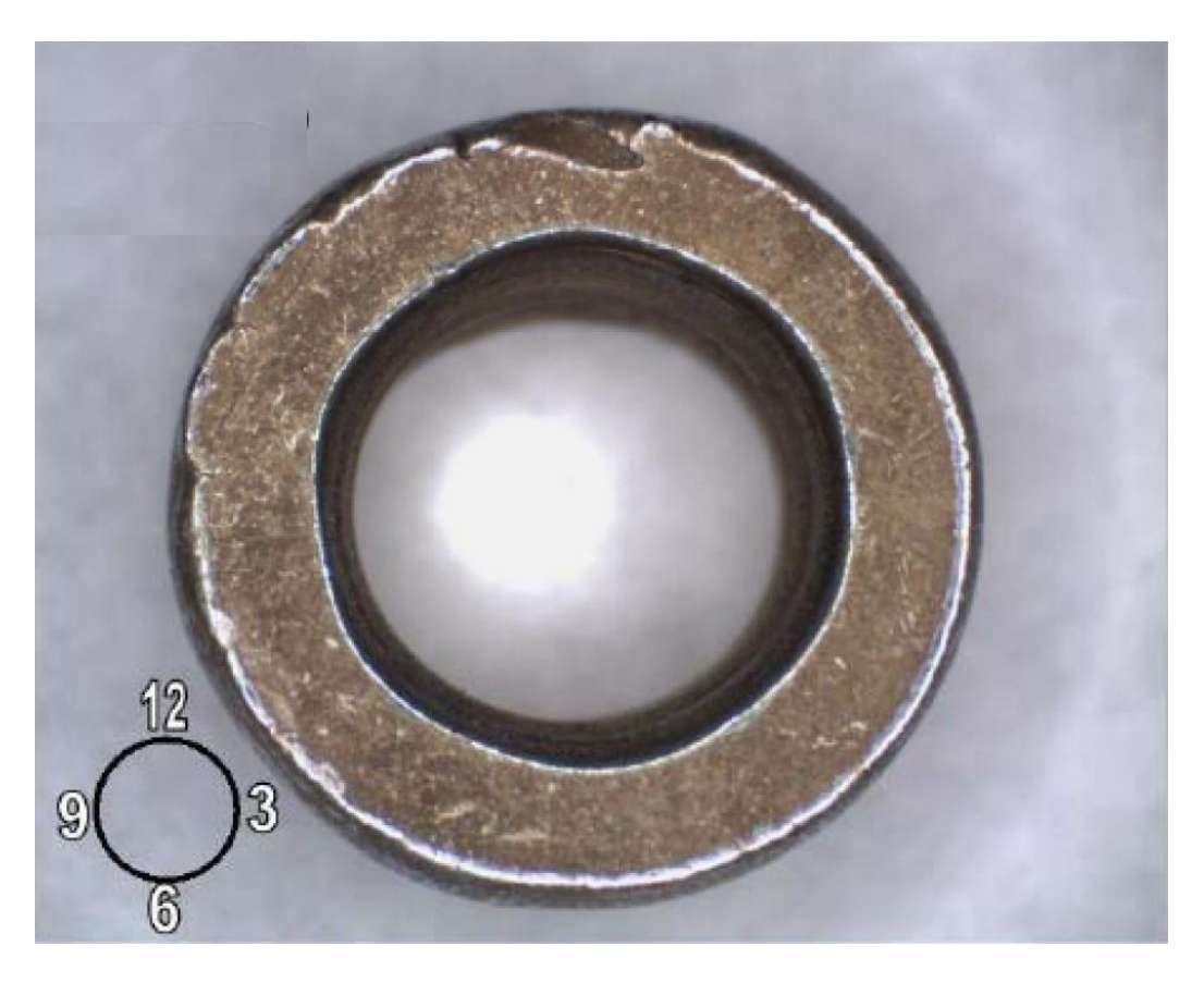
Figure 1: Example of surface irregularities observed on a nut. Overall view.