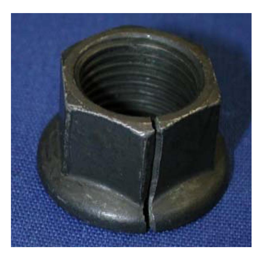
Figure 3: Example of longitudinal crack.

Note: The nut should be tested for wrenching torque by the use of a box or a socket wrench.