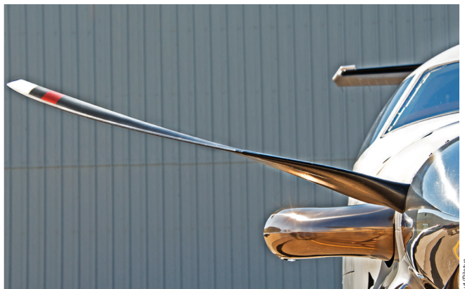
New composite propeller cuts time to climb by about 10%