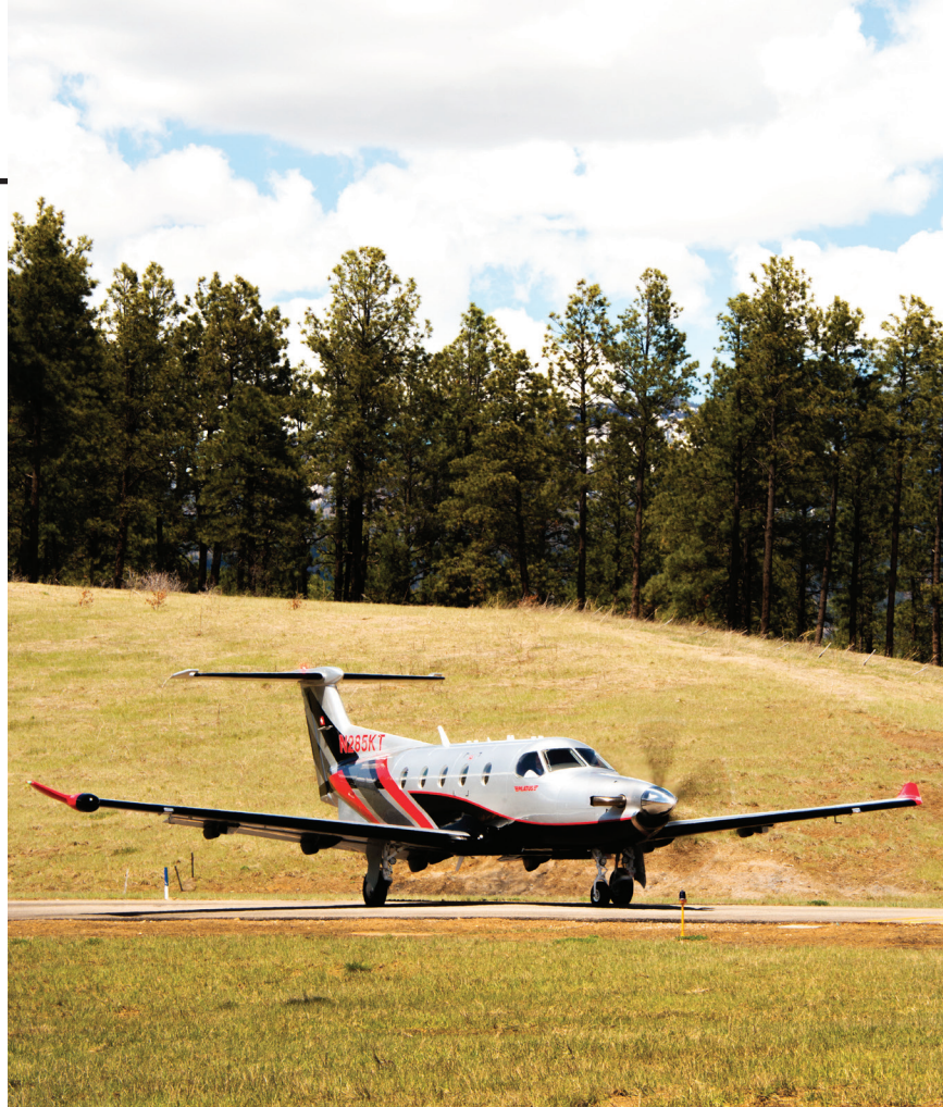
One benefit of the new, stiffer five-bladed propeller is a 2-3dB cockpit/cabin noise reduction

At FL240 I set maximum continuous power (780°C interstage turbine temperature) and let the aircraft accelerate to its maximum speed. The 3,924kg NG stabilised at 184KIAS. At a static air temperature of 26°C, a fuel flow of 417PPH gave us a true airspeed of 272kt. Pilatus does publish a long-range cruise speed for the NG, but it is seldom used as the meagre