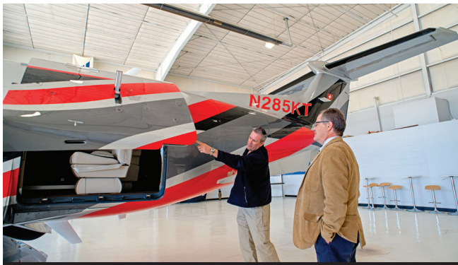
1.35m x 1.32m cargo door opens onto PC-12’s generous cabin

Johnson guided me through the start procedure for the 1,200shp (895kW) PT6 from the right seat. Once it was running, the dual electrical generators automatically came on line. Post-start and pre-taxi flows were a snap to accomplish. Once the parking brake was released, a slight bump of the power control lever got the big single moving. With the condition lever in the ground idle detent, prop speed was slowed to 1,000rpm, facilitating a nice taxi pace. Rudder pedal-actuated nose wheel steering allowed me to track taxiway