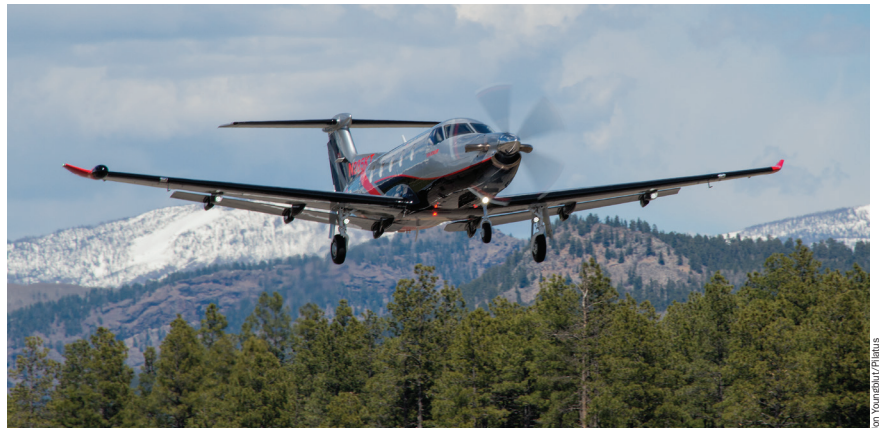
With its new propeller and more powerful engine, the PC-12 outperforms many turbine twins

After shutdown on Pilatus’s ramp, I reflected back on both this day’s and my previous flight in the PC-12. The current NG is no doubt a better aircraft than the one I had flown 11 years earlier. The five-bladed composite scimitar propeller combines with the more powerful PT6A-67P to give marked improvements to field, climb and cruise performance. The updated Apex flight deck, with its Smartview synthetic vision system, was very capable and showed its mettle in routine and simulated emergency situations. The PC-12NG is a success because at its core it is a minimalistic aircraft. It needs only a single engine to outperform numerous turbine twins. It is single-pilot certificated, catering to owner-operators and flight departments. It has one large cabin that can be configured for any number of purposes. Since its launch in 1989 the PC-12 has proven itself one very successful aircraft. Sometimes, less is more. ■