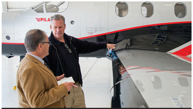
Cleaner aerodynamics help boost cruise speed to 285KTAS